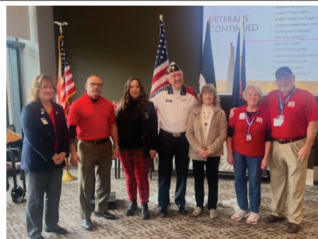
MVH Vietnam Pinning Ceremony Volunteers