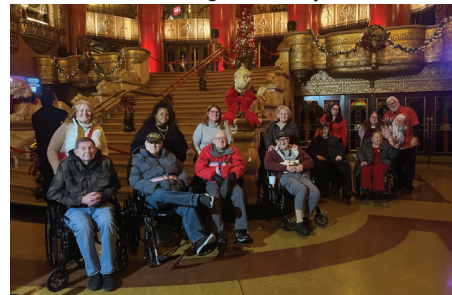
MVH Veterans at the Fox Theater